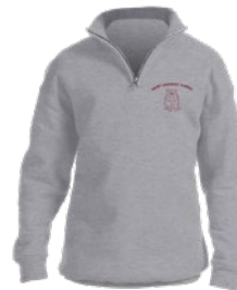
1/4 Zip Cotton Sweatshirt Adult $47 / Youth $42 VINTAGE GRAY