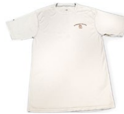
Short Sleeve Holloway Dri-Fit Shirt $20 COLORS: WHITE, MAROON, OR GRAY