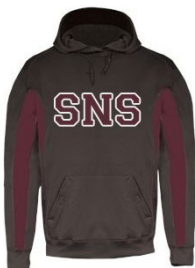
Badger Sport Dri Fleece Hoodie $50 ADULT SIZES ONLY