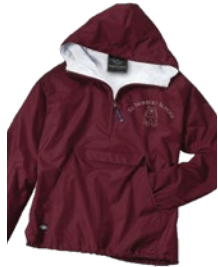
Windbreaker Lined $50 / Unlined $45