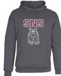
Badger Sport Dri Fleece Hoodie $45 GREY, YOUTH SIZES ONLY