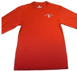
Long Sleeve Holloway Dri-Fit Shirt $25 COLORS: WHITE, MAROON, OR GRAY