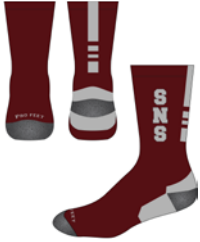
Performance Shooter Crew Sock $12 SHOE SIZES LISTED BELOW