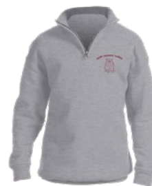
1/4 Zip Cotton Sweatshirt Adult $47 / Youth $42 VINTAGE GRAY